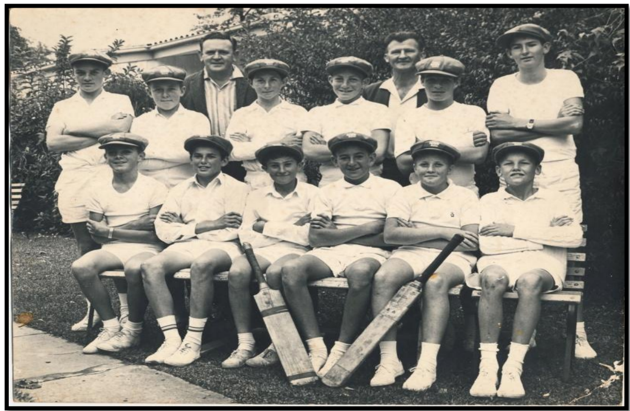
50<sup>th</sup> Anniversary of the Club's first Premiership – 1965/66 14B Premiers