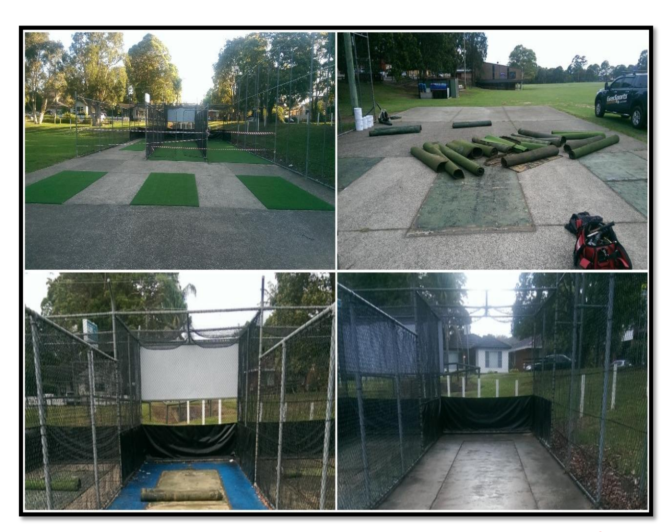
Thank you to the Sutherland Shire Council and the assistance of the SSJCA for our Practice Nets Upgrade this season