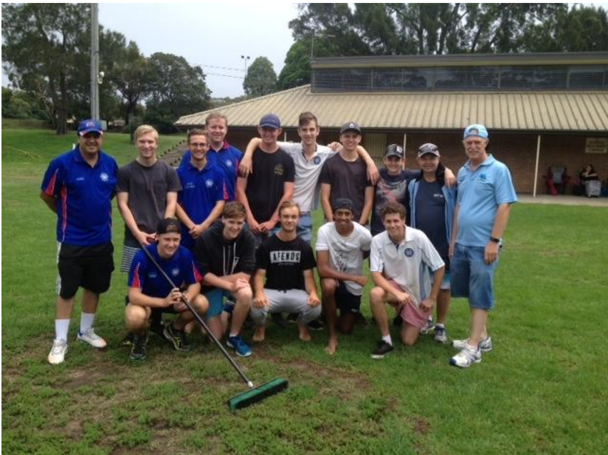
C1 Runners Up