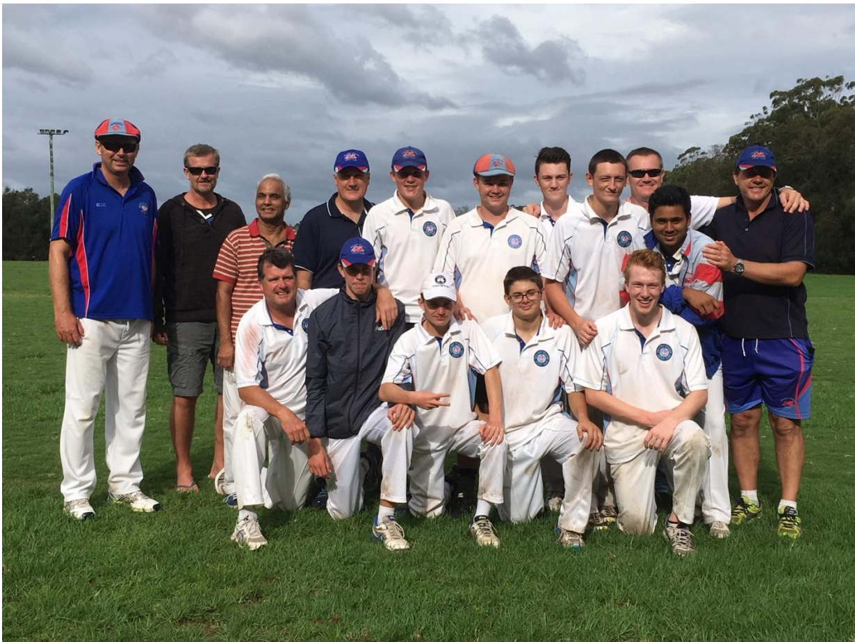
B4 Runners Up