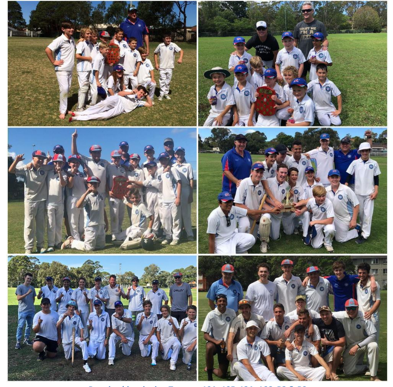
Premiership winning Teams – 10A, 10F, 12A, 16C, B2 & B3