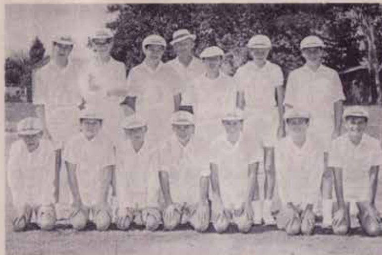
Moore Shield (1), 1967-68