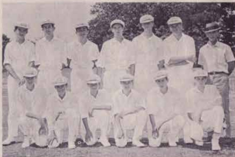
C. S. Watson Shield, 1967-68