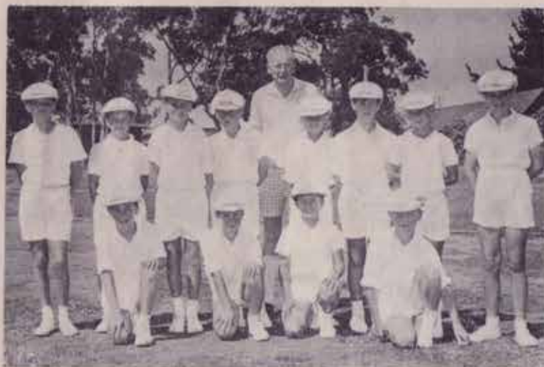
Cowsey Shield (2), 1967-68