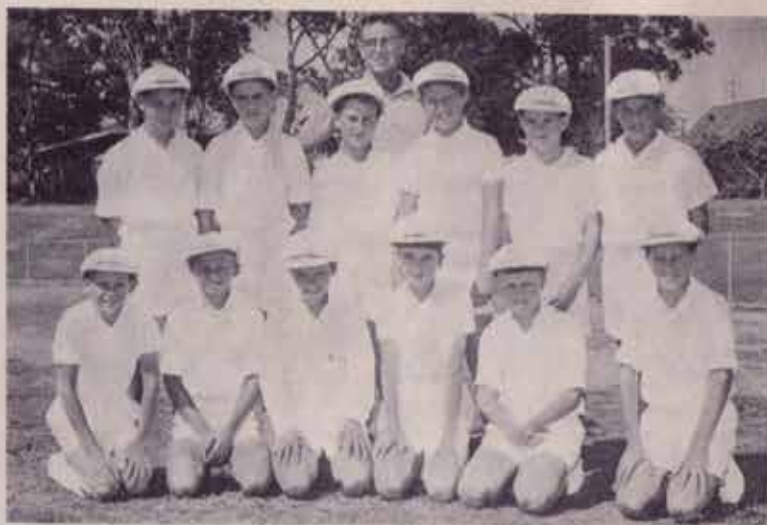
Cowsey Shield (1), 1967-68