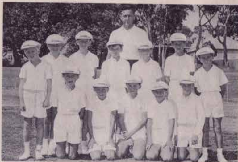
Foster Shield (1), 1967-68