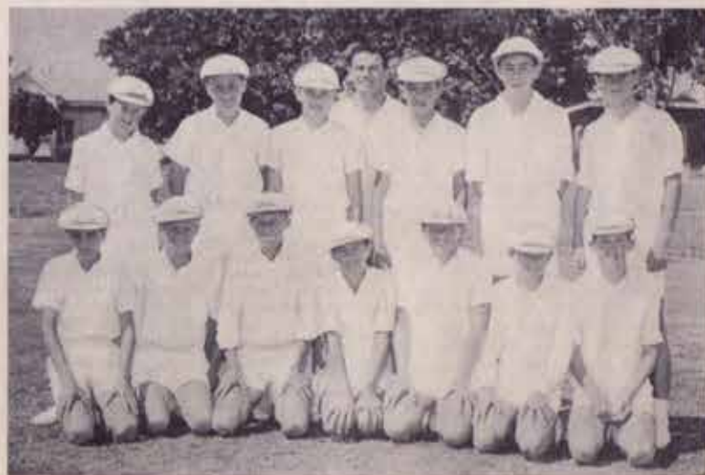
Moore Shield (2), 1967-68