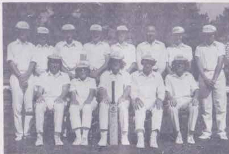
C. S. WATSON SHIELD NO. 1 TEAM