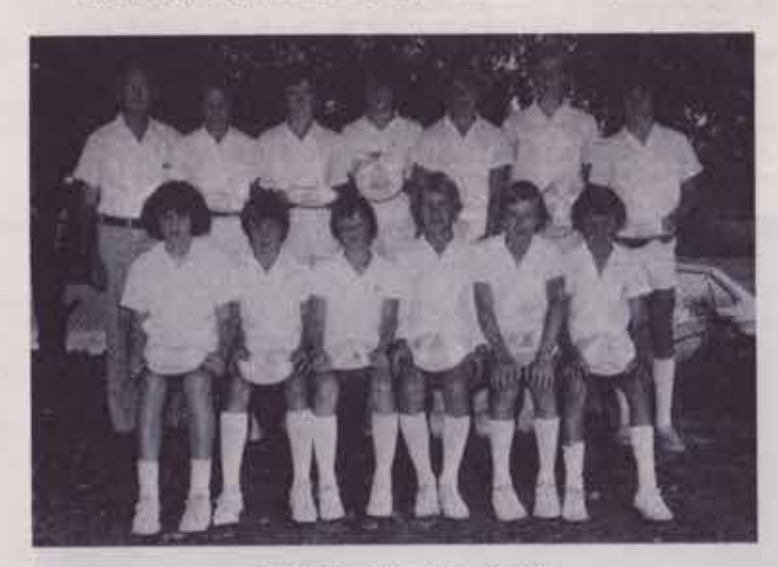
HAROLD MOORE SHIELD NO. 2 SIDE

28- 1-80 Sutherland - V - Bankstown. Sutherland 9-134 (K. Tuite 32, P. Gough 29) Defeated Bankstown 130 (S. Woodley 2-19, P. Walsh 5-51, N . Lovelock 2-24).