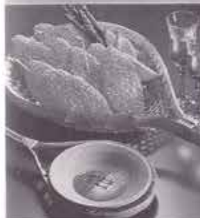
Breaded Fish Portions