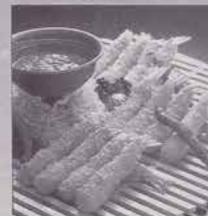
Now Coconut Breaded Prawns