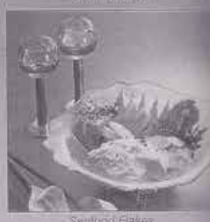
Seafood Flakes Seafood Sticks