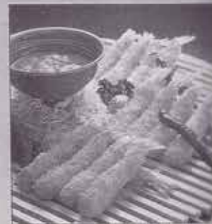
New Coconut Breaded Prawns

NICHIREI PREMIUM QUALITY SEAFOODS AT AFFORDABLE PRICES