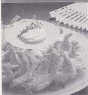
Breaded Fish with Curries