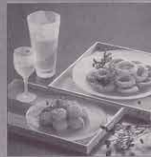
Chilled Seafood Platter