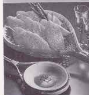
Breaded Fish Portions