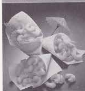
Tempura Giant Prawns