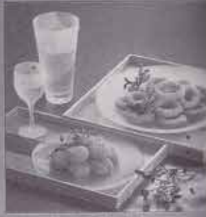
Assorted Fried Items Served with Dips