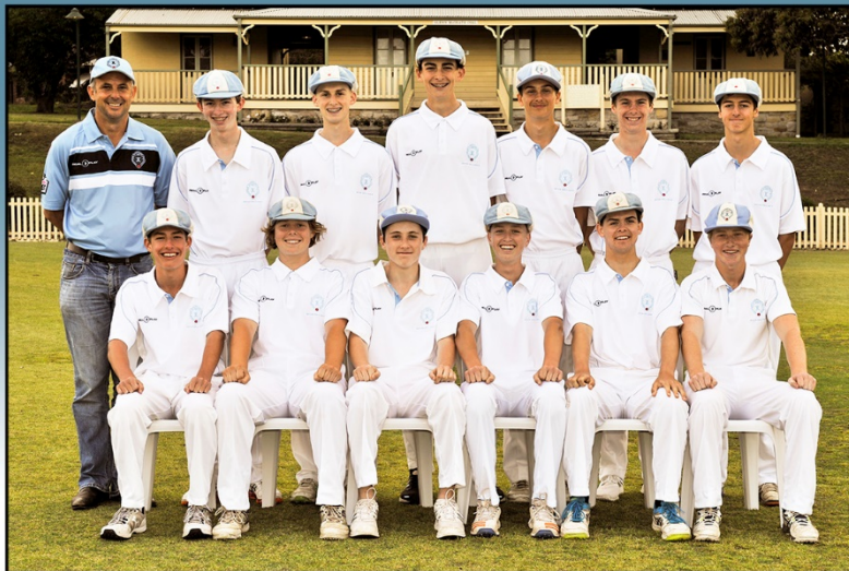
U16 Watson Shield Q'Finalists