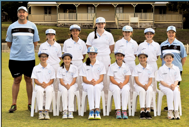
Under 13 Mollie Dive Shield - Joint Premiers