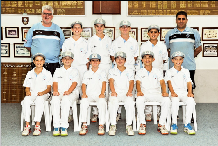
Semi Finalists 2018 - 2019