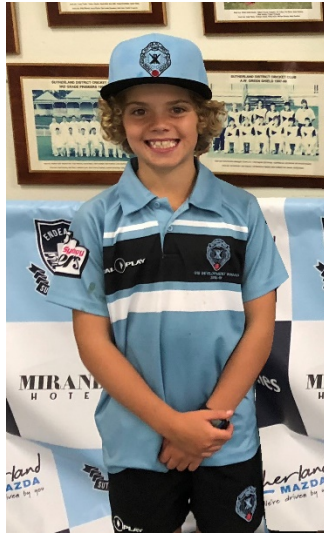
Andrew Hilditch Trophy