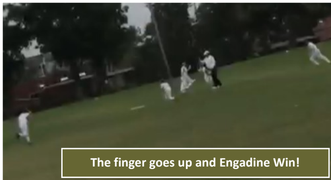
The finger goes up and Engadine Win!

They have done the most amazing feat of taking 7 wickets for just 4 runs to win a grand final!