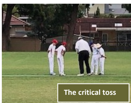
The critical toss