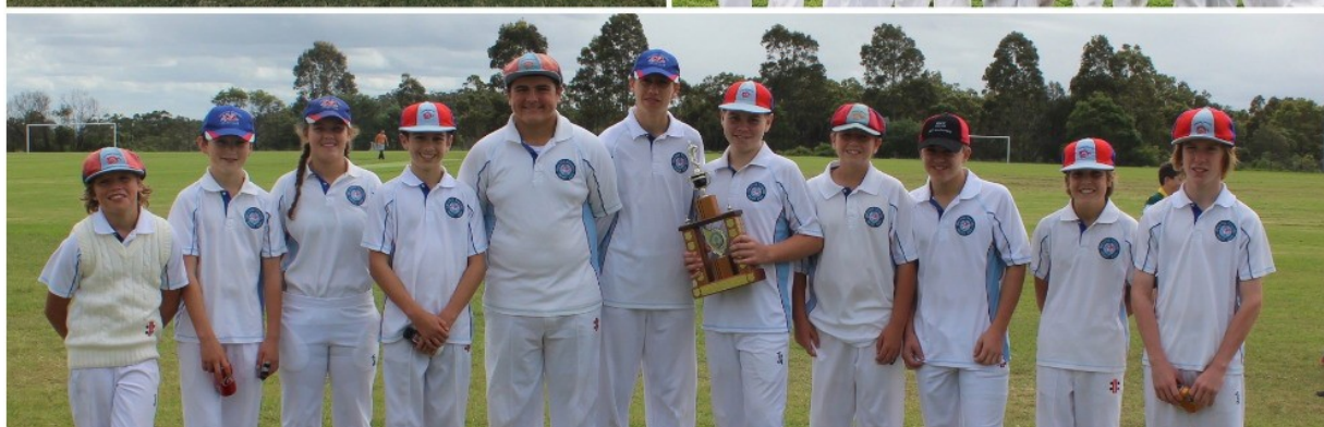
PREMIERS — B2, 14A, 14B, 12A, 10E TEAMS — RUNNERS UP — 12B, 16A TEAMS