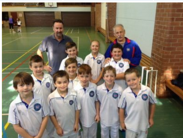
2014 - DRAGONS U10 DEVELOPMENT SQUAD