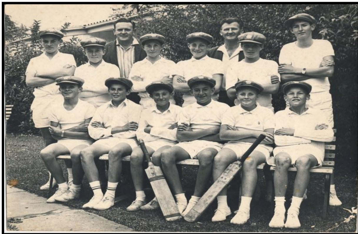
50 th Anniversary of the Club's first Premiership – 1965/66 14B Premiers