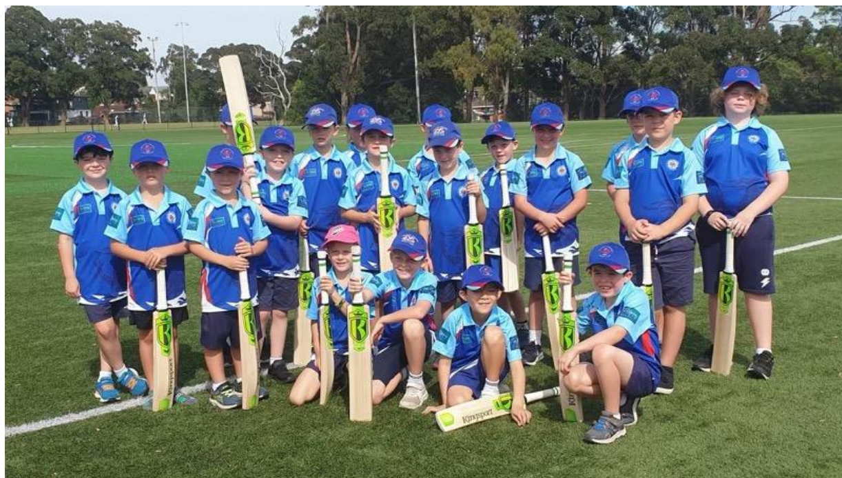
Our Master Blasters with their new bats