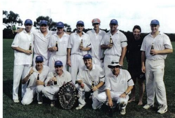
1999/2000 & 2000/2001 A1 Premiers Re-union