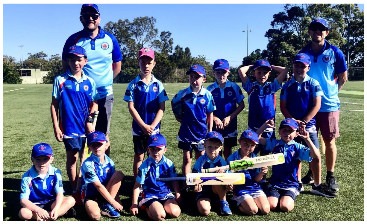
The Heat take on the Flames in the local derby