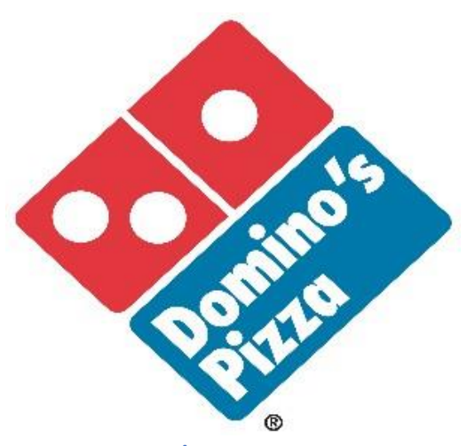
DOMINO'S PIZZA ENGADINE