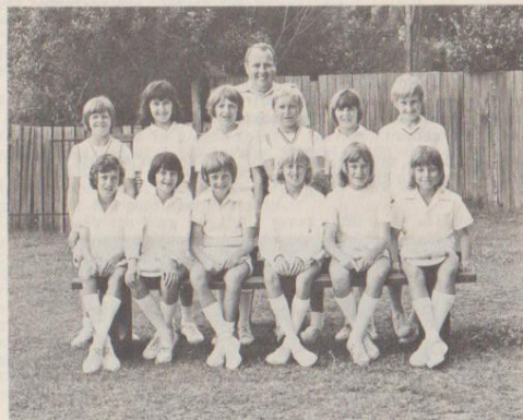
ARCH CASEY NO. 2 SIDE