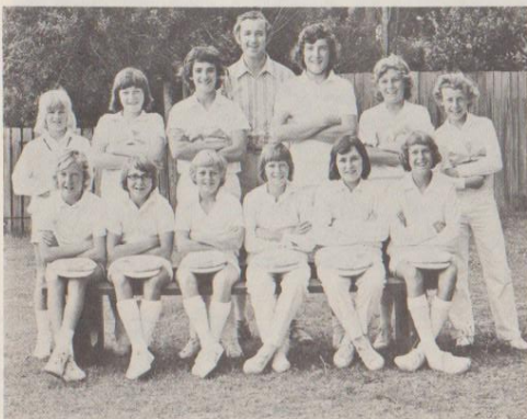
HAROLD MOORE SHIELD NO. 2 TEAM