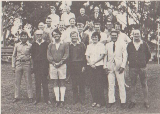
PHOTO SHOWS THE OFFICIALS OF THE QUEENSLAND TOURING PARTY TAKEN WITH THE MEMBERS OF THE EXECUTIVE OF OUR ASSOCIATION AT CARINGBAH OVAL ON THEIR DAY OF DEPARTURE.

To all members of the Sutherland Shire Cricket Association, Boys' Competition: Ladies and Gentlemen,