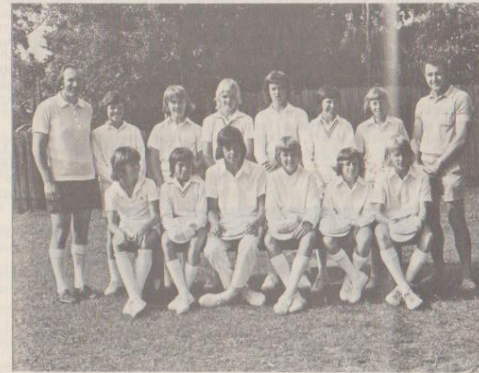
HAROLD MOORE SHIELD NO. 1 TEAM