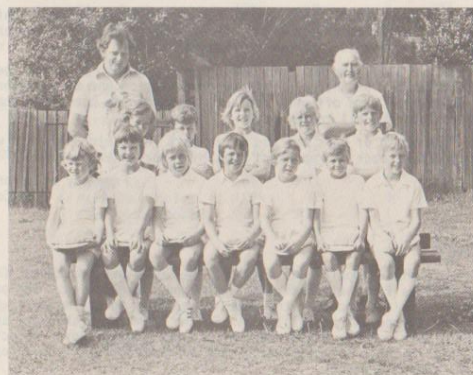
FOSTER SHIELD NO. 2 TEAM