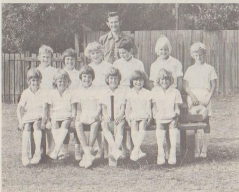
FOSTER SHIELD NO. 1 TEAM.