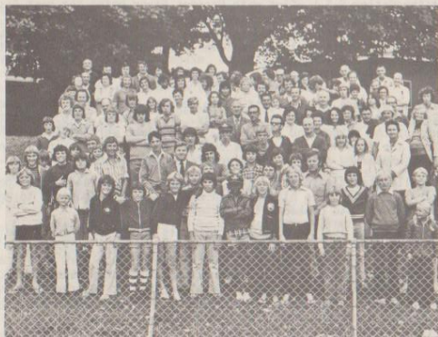
PHOTO OF GROUP AT CARINGBAH OVAL FOR THE FAREWELL BARBECUE

I must also thank the Queensland Tourists who afforded us the opportunity of meeting them and giving us some handy hints if we have a return trip of this kind.