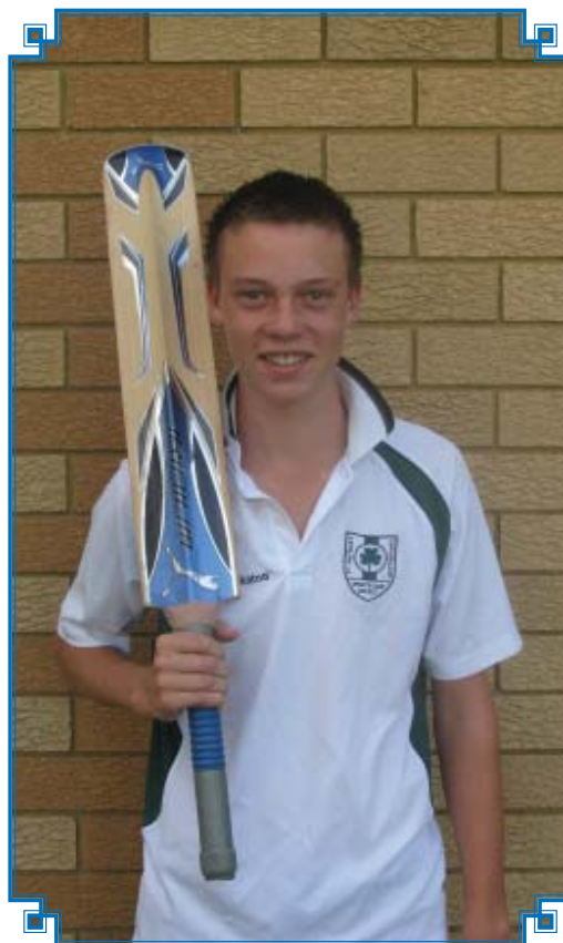
The John Woodhouse Memorial Trophy