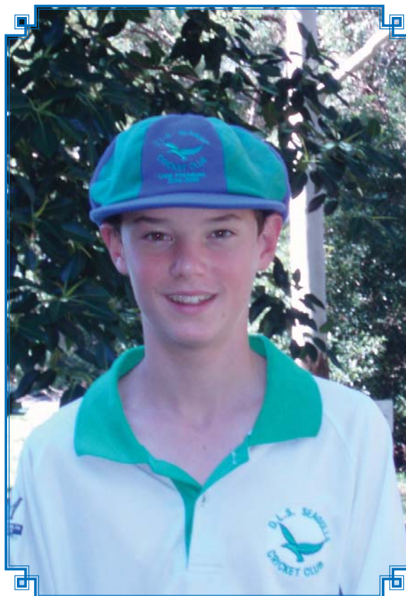
Alan Craston Memorial Trophy

The DLS Seagulls Club congratulates him on his performances throughout the season and wishes him the best for the future.