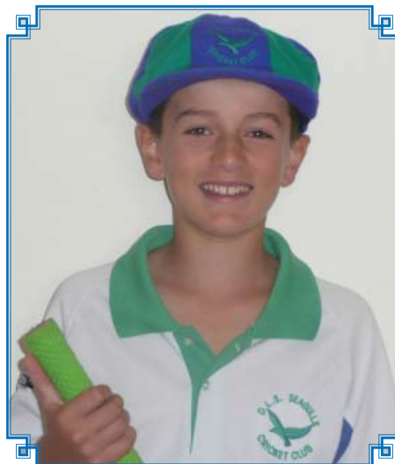
Andrew Hilditch Trophy